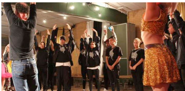
Zone R-Fam Dance Crew, Outer Urban Projects, Arts Partner 15-16