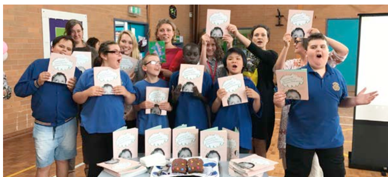
Think Up, Dream Up, Places Unknown, Croxtton School & Kids Own Publishing, Arts Partner 16-17